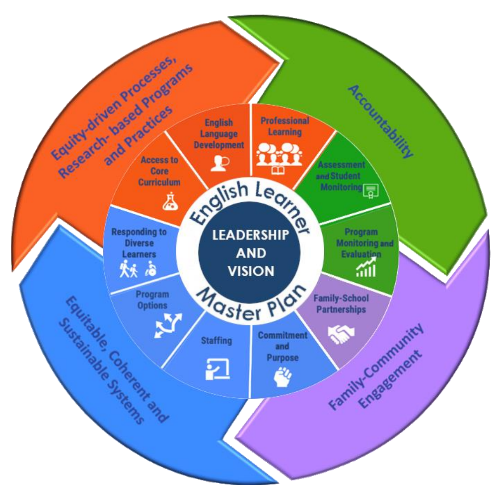
Figure 1. English Learner Master Plan Goals and Components